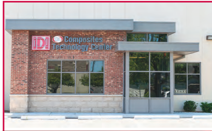
The IDI 3i Composites Technology Center

The IDI 3i Composites Technology Center is the research and development division of IDI Composites International. It will generate and prove new ideas, approaches and materials to address the engineering and performance challenges of both our customers and the industry.