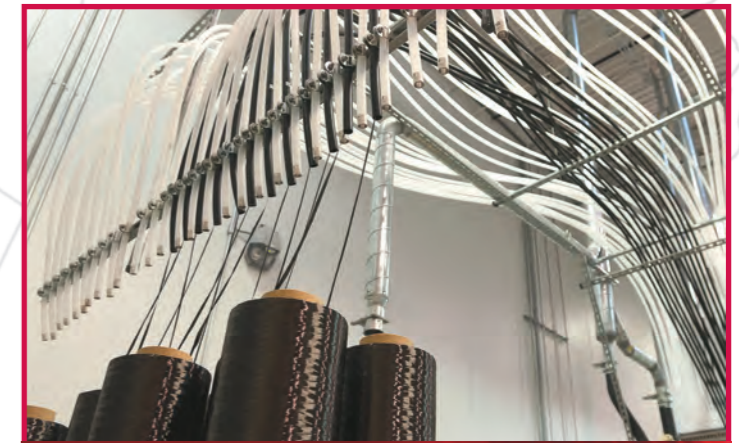
Material Development And Testing