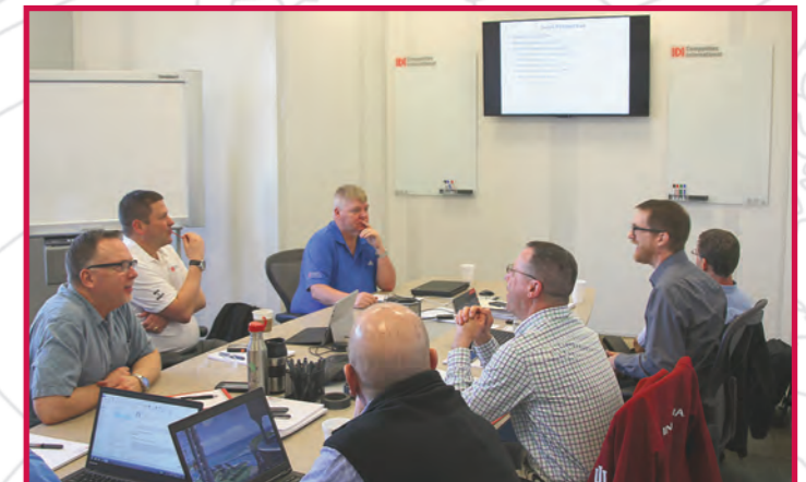
The 3i Composites Technology Conference Center