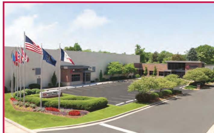
IDI World Headquarters

The IDI 3i Composites Technology Center's mission is to design, develop and manufacture thermoset composite compounds for innovative customers seeking to go beyond the value limitations of conventional materials.