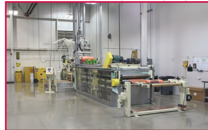
SMC Machine Customized For STC Product Development