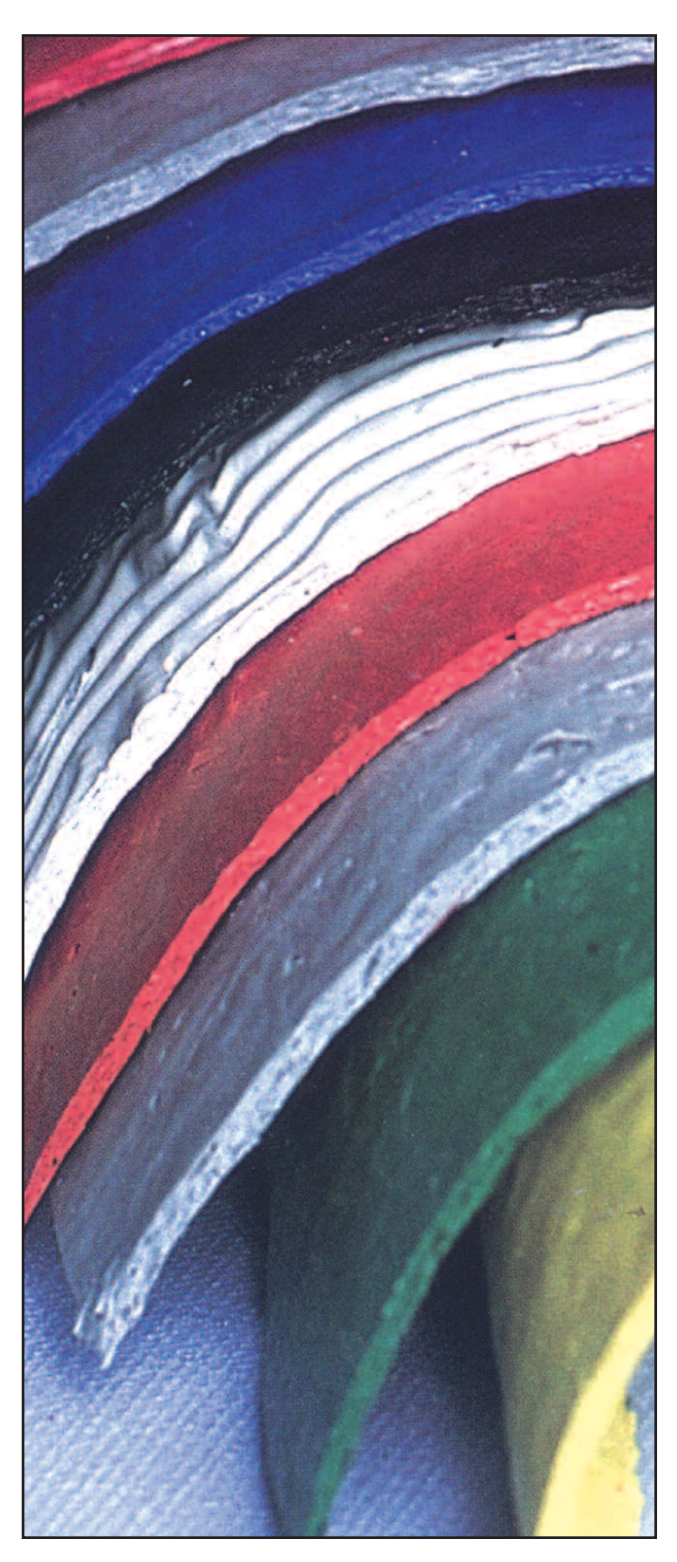
IDI SMC can be formulated with 10 – 60 percent glass content depending on the physical requirements of the application.

As for reinforcement, many types of reinforcement fiber can be used for structural thermosets, depending on the molding