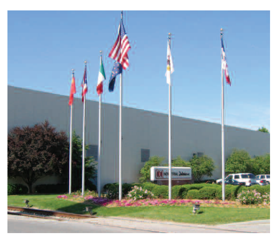
IDI Composites International global headquarters in Noblesville, Indiana USA

Headquartered in a 120,000 square foot facility in Noblesville, IN (USA), IDI has a strong presence in the international thermoset composites market. To support a growing customer base worldwide, the company operates multiple wholly owned manufacturing facilities in Europe, Asia, and The Americas. For more information, please visit www.idicomposites.com.