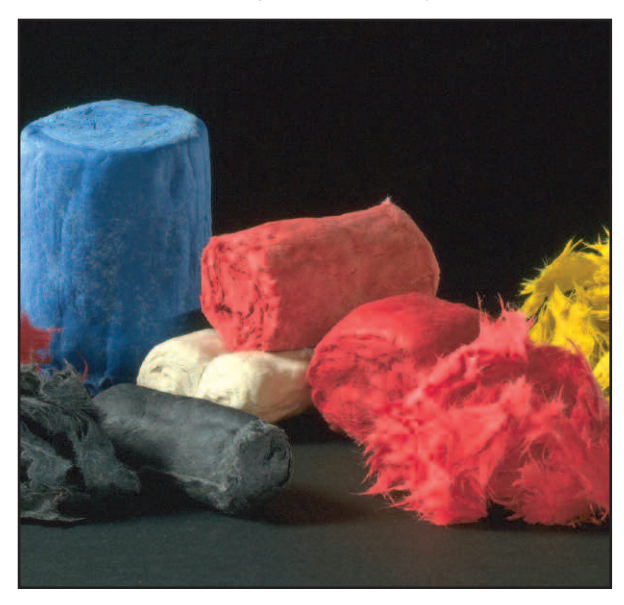
IDI BMC can be molded in a variety of colors.

Thermoset molding compounds are one product family that has been dramatically enhanced during the past decade. Historically, thermoset molding compounds would use a limited amount of chemistry to achieve acceptable performance. However, in the last decade there have been a variety of new resins, glass reinforcements, and additives that have allowed thermoset molding compounds to be used in structural applications that were impossible decades earlier. We call this new family of high-performance products, Structural Thermoset Compounds. Structural thermosets are offered in the same form as traditional thermoset compounds, which makes their integration into standard molding and tooling efficient. Structural thermosets are available in either sheet molding compound (SMC) or bulk molding compound (BMC) formats. These unique formulations are then customized to achieve high performance results. The new products have the benefit of advanced resin systems coupled with high levels of fiber glass or carbon reinforcement for strength and durability. This added