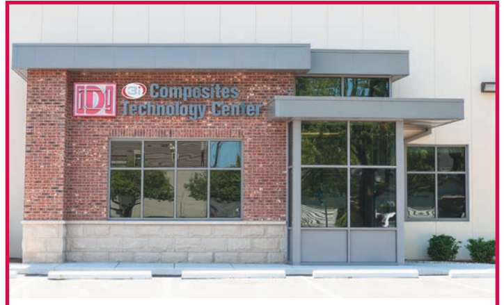
The IDI 3i Composites Technology Center

The IDI 3i Composites Technology Center is the research and development division of IDI Composites International. It will generate and prove new ideas, approaches and materials to address the engineering and performance challenges of both our customers and the industry.