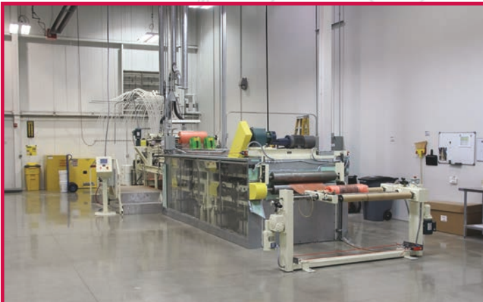
SMC Machine Customized For STC® Product Development