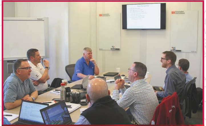
The 3i Composites Technology Conference Center