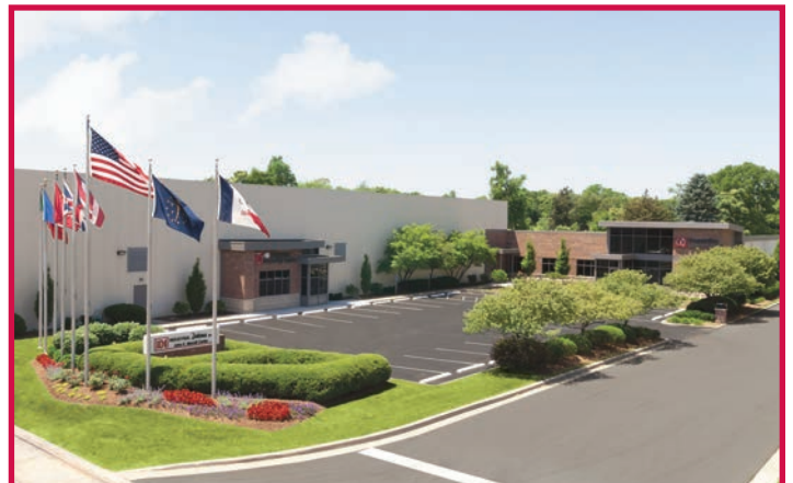
IDI World Headquarters

The IDI 3i Composites Technology Center's mission is to design, develop and manufacture thermoset composite compounds for innovative customers seeking to go beyond the value limitations of conventional materials.