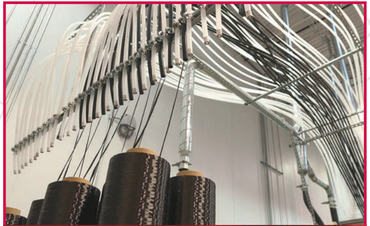
Material Development And Testing